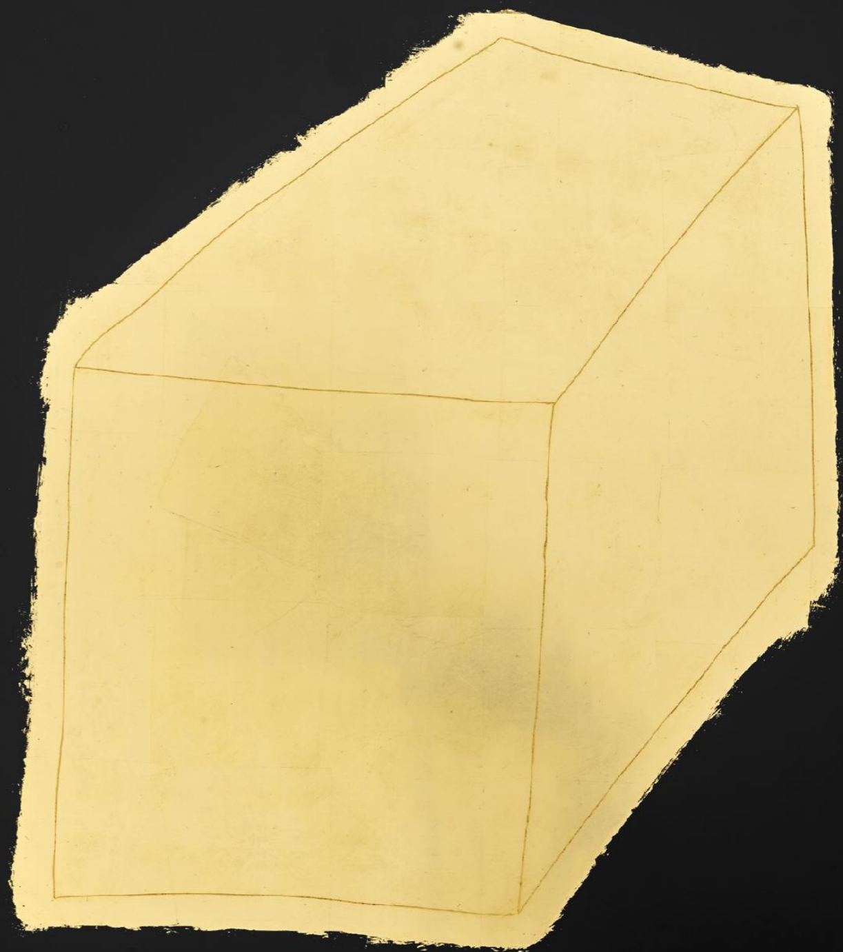
Untitled 2017 Gold leaf on urushi panel 100 x 100 cm Ref. A1023.137 70.000 USD + tax if applicable